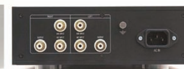
HEQA01 Rear View